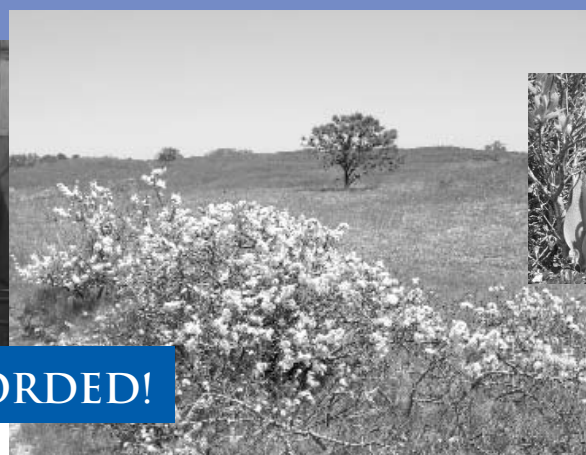
On the west side of the Loring tract, which was preserved this spring.