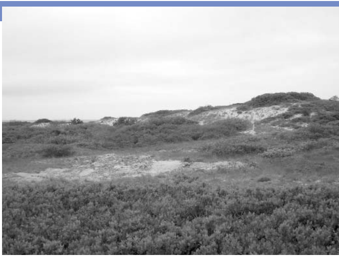
From Eel Point Road looking north across the land which, although defined as “dune fields,” now is proposed for development.