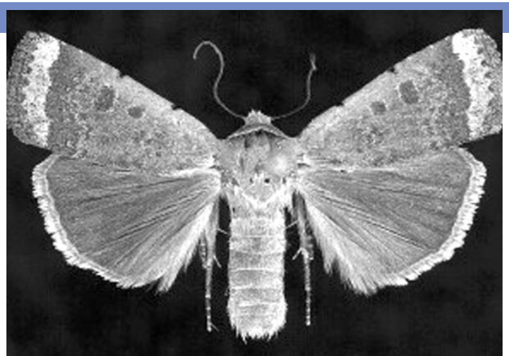
Abagrotis nefascia , or Coastal Heathlands Cutworm, is a coastal heathlands and coastal shrublands specialist. It is a state listed species of special concern and one of four rare moths found during the NLC's initial surveys of the Loring property.

Curious about Nantucket's unique animals and plants? Then mark your calendar for September 22nd and plan to attend an interesting array of lectures and presentations organized by the Nantucket Biodiversity Initiative. For more information contact Emily Molden at 508-228-2818 or emily@nantucketlandcouncil.org