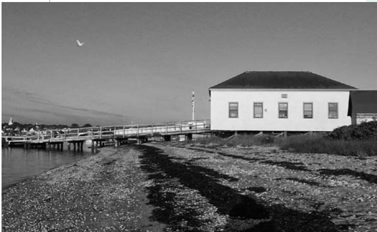
Shellfish Propagation Lab