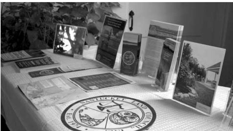
NLC exhibit at Garden Club Flower Show

The NLC also participated in the Garden Club's 46th annual Green Thumb Flower Show this summer with a conservation exhibit on fertilizer impacts on our water resources. The exhibit was educational, with an emphasis on using native plants in garden and landscaping installations. Brochures and pamphlets at the exhibit emphasized that native plants require little to no fertilizer and drastically reduce the application rates necessary for a property. The NLC exhibit was recognized with the Marion Thompson Fuller Brown Conservation Award.